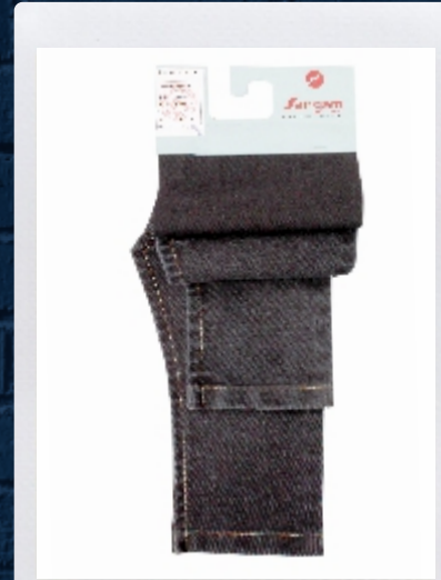
Article : PD E114 Shade : Sulphur Black | Weave : 3/1 RHT Weight : 11.25 Oz/Sq.Yd | Width : 66.00" ± 1 Weft Shrinkage : 0-2%