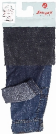
Article : 3290 Shade : Dark Indigo | Weave : 2/1 RHT Weight : 4.75 Oz/Sq.Yd | Width : 66.00" ± 1 Weft Shrinkage : 0-2%