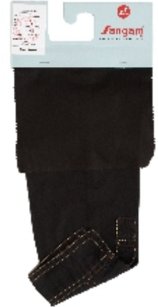
Article : 7093 Shade : Sulphur Black | Weave : 2/1 RHT Weight : 5.00 Oz/Sq.Yd | Width : 60.00" ± 1 Weft Shrinkage : 0-2%