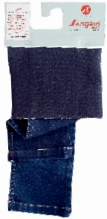
Article : 3310 Shade : Dark Indigo | Weave : 2/1 RHT Weight : 10.00 Oz/Sq.Yd | Width : 72.00" ± 1 Weft Shrinkage : 12-14%