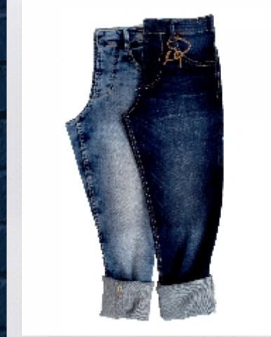
Article : PD E308 Shade : Dark Indigo | Weave : 3/1 RHT Weight : 9.50 Oz/Sq.Yd | Width : 62.00" ± 1 Wefit Shrinkage : 12-14%