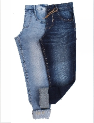
Article : TD 463 Shade : Dark Indigo | Weave : 3/1 RHT Weight : 9.50 Oz/Sq.Yd | Width : 64.00" ± 1 Wefit Shrinkage : 18-20%