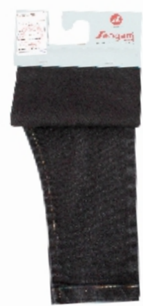
Article : 7074 Shade : Sulphur Black | Weave : 3/1 RHT Weight : 11.50 Oz/Sq.Yd | Width : 61.00" ± 1 Weft Shrinkage : 14-16%