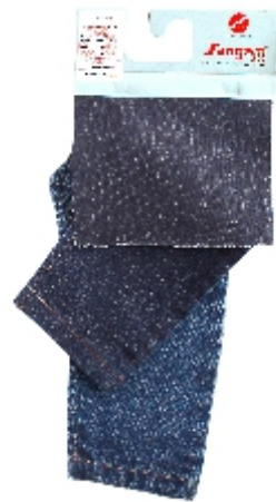
Article : 3925 Shade : Indigo | Weave : 3/1 RHT Weight : 14.00 Oz/Sq.Yd | Width : 67.00" ± 1 Wef Shrinkingage : 0-2%