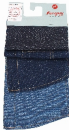
Article : 3550 Shade : Indigo | Weave : 2/1 RHT Weight : 7.50 Oz/Sq.Yd | Width : 67.00" ± 1 Weft Shrinkage : 0-2%