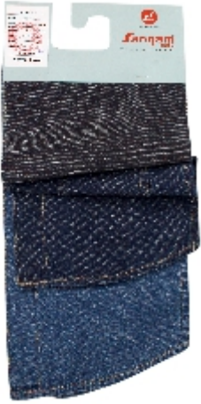
Article : 3253 Shade : Dark Indigo | Weave : 2/1 RHT Weight : 6.50 Oz/Sq.Yd | Width : 59.00" ± 1 Weft Shrinkage : 0-2%