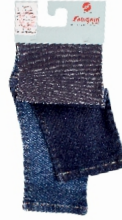
Article : 3230 Shade : Dark Indigo | Weave : 3/1 RHT Weight : 10.25 Oz/Sq.Yd | Width : 64.00" ± 1 Weft Shrinkage : 14-16%