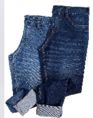
Article : 3628 Shade : Dark Indigo | Weave : 3/1 RHT Weight : 11.50 Oz/Sq.Yd | Width : 67.00" ± 1 Wef Shrinkingage : 0-2%