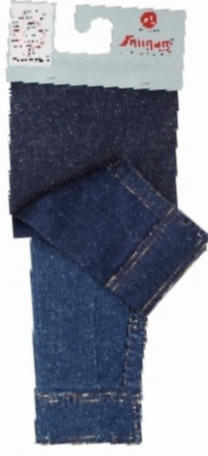
Article : 3239 Shade : Dark Indigo | Weave : 2/1 RHT Weight : 6.00 Oz/Sq.Yd | Width : 62.00" ± 1 Weft Shrinkage : 16-18%