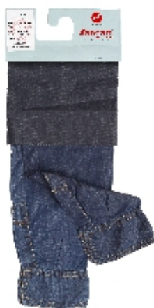
Article : PD D524 Shade : Dark Indigo | Weave : 2/1 RHT Weight : 4.75 Oz/Sq.Yd | Width : 65.00" ± 1 Weft Shrinkage : 0-2%