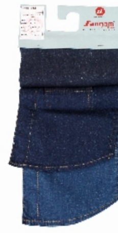
Article : 3263 Shade : Dark Indigo | Weave : 2/1 RHT Weight : 5.25 Oz/Sq.Yd | Width : 59.00" ± 1 Weft Shrinkage : 6-8%