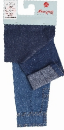
Article : 3221 Shade : Indigo | Weave : 2/1 RHT Weight : 5.25 Oz/Sq.Yd | Width : 59.00" ± 1 Weft Shrinkage : 6-8%