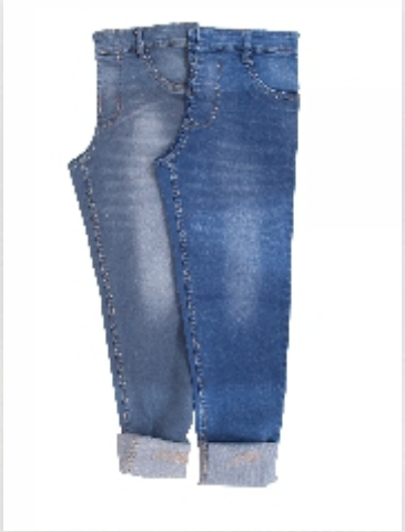
Article : 3655 Shade : Sulphur Indigo Blue | Weave : 3/1 RHT Weight : 9.75 Oz/Sq.Yd | Width : 61.00" ± 1 Wefit Shrinkage : 18-20%