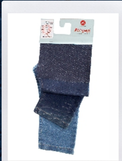
Article : 3720 Shade : Indigo | Weave : 3/1 RHT Weight : 11.00 Oz/Sq.Yd | Width : 66.00" ± 1 Weft Shrinkage : 0-2%