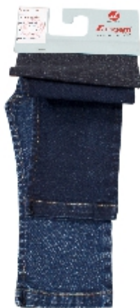
Article : 3530 Shade : Dark Indigo | Weave : 3/1 RHT Weight : 10.00 Oz/Sq.Yd | Width : 62.00" ± 1 Weft Shrinkage : 16-18%