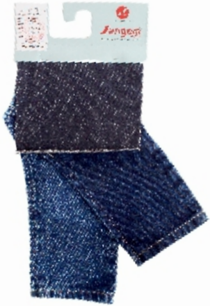
Article : 3308 Shade : Indigo | Weave : 3/1 RHT Weight : 14.50 Oz/Sq.Yd | Width : 71.00" ± 1 Wef Shrinkingage : 0-2%