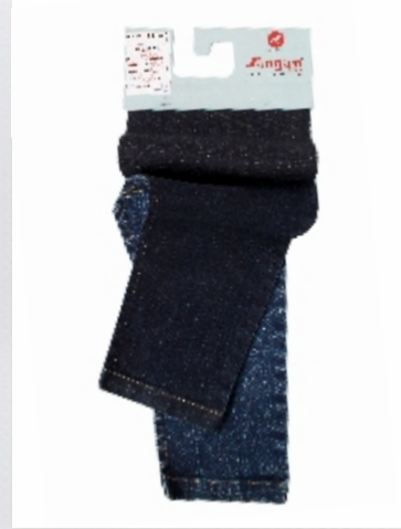
Article : PD E250 Shade : Super Dark Indigo | Weave : 3/1 RHT Weight : 10.25 Oz/Sq.Yd | Width : 67.00" ± 1 Wefit Shrinkage : 12-14%