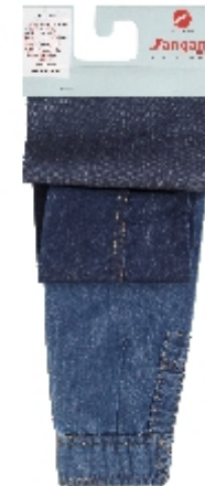
Article : 3562 Shade : Dark Indigo | Weave : 2/1 RHT Weight : 4.75 Oz/Sq.Yd | Width : 62.00" ± 1 Weft Shrinkage : 0-2%