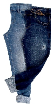
Article : 3551 Shade : Indigo | Weave : 3/1 RHT Weight : 12.00 Oz/Sq.Yd | Width : 62.00" ± 1 Weft Shrinkage : 12-14%