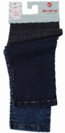
Article : 3240 Shade : Dark Indigo | Weave : 3/1 RHT Weight : 11.00 Oz/Sq.Yd | Width : 62.00" ± 1 Weft Shrinkage : 18-20%