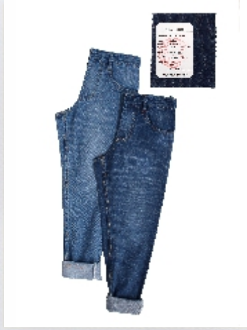
Article : PD E299 Shade : Indigo | Weave : 3/1 RHT Weight : 10.25 Oz/Sq.Yd | Width : 67.00" ± 1 Weft Shrinkage : 0-2%