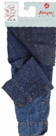
Article : 3538 Shade : Dark Indigo | Weave : 2/1 RHT Weight : 5.25 Oz/Sq.Yd | Width : 65.00" ± 1 Weft Shrinkage : 0-2%