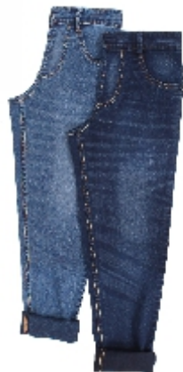
Article : 3615 Shade : SBIT | Weave : 2/1 RHT Weight : 7.25 Oz/Sq.Yd | Width : 60.00" ± 1 Weft Shrinkage : 12-14%