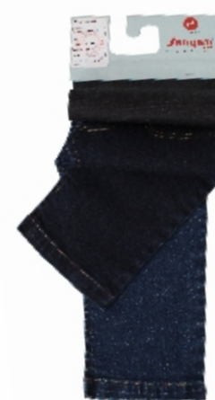
Article : 3598 Shade : SBIT | Weave : 3/1 RHT Weight : 9.75 Oz/Sq.Yd | Width : 61.00" ± 1 Weft Shrinkage : 18-20%