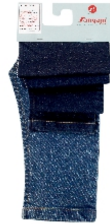
Article : 3924 Shade : Indigo | Weave : 3/1 RHT Weight : 11.50 Oz/Sq.Yd | Width : 61.00" ± 1 Weft Shrinkage : 12-14%