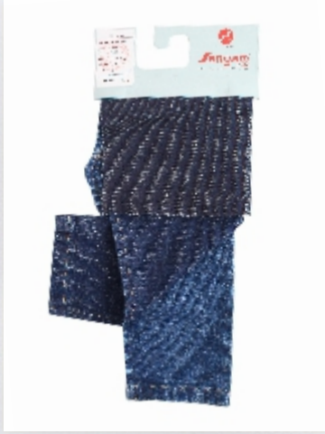
Article : PD E297 Shade : Indigo | Weave : 3/1 RHT Weight : 10.75 Oz/Sq.Yd | Width : 66.00" ± 1 Weft Shrinkage : 0-2%