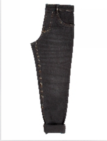
Article : 3656 Shade : Sulphur Black | Weave : 3/1 RHT Weight : 9.25 Oz/Sq.Yd | Width : 61.00" ± 1 Wefit Shrinkage : 10-12%