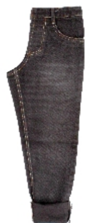
Article : 7059 OD Shade : Sulphur Black | Weave : 3/1 RHT Weight : 12.75 Oz/Sq.Yd | Width : 66.00" ± 1 Wef Shrinkingage : 0-2%