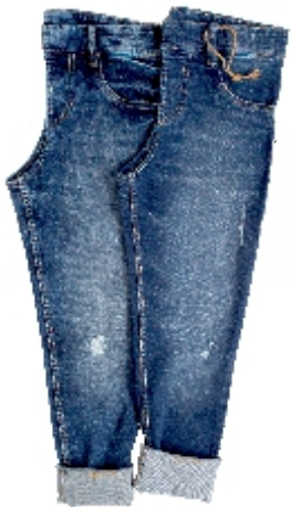
Article : 3284 Shade : Dark Indigo | Weave : 3/1 RHT Weight : 10.50 Oz/Sq.Yd | Width : 61.00" ± 1 Weft Shrinkage : 12-14%