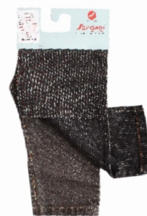
Article : 7059 Shade : Sulphur Black | Weave : 3/1 RHT Weight : 13.75 Oz/Sq.Yd | Width : 66.00" ± 1 Wef Shrinkingage : 0-2%