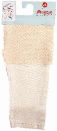
Article : 1042 Shade : ECRU | Weave : 3/1 RHT Weight : 12.25 Oz/Sq.Yd | Width : 64.00" ± 1 Weft Shrinkage : 14-16%