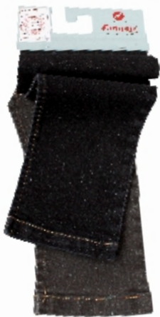
Article : 7104 Shade : Sulphur Black | Weave : 3/1 RHT Weight : 10.75 Oz/Sq.Yd | Width : 72.00" ± 1 Weft Shrinkage : 12-14%