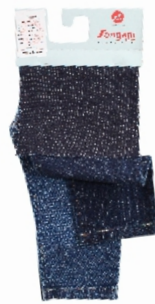
Article : 3510 Shade : Dark Indigo | Weave : 3/1 RHT Weight : 11.00 Oz/Sq.Yd | Width : 67.00" ± 1 Wef Shrinkingage : 0-2%