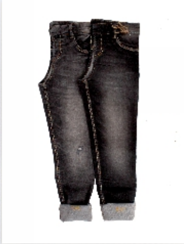
Article : 7071 Shade : Sulphur Black | Weave : 3/1 RHT Weight : 9.75 Oz/Sq.Yd | Width : 61.00" ± 1 Wefit Shrinkage : 18-20%