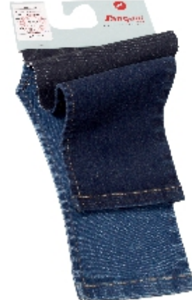
Article : 3222 Shade : Dark Indigo | Weave : 3/1 RHT Weight : 9.75 Oz/Sq.Yd | Width : 60.00" ± 1 Weft Shrinkage : 14-16%