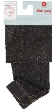
Article : 7092 Shade : Sulphur Black | Weave : 2/1 RHT Weight : 5.25 Oz/Sq.Yd | Width : 59.00" ± 1 Weft Shrinkage : 6-8%