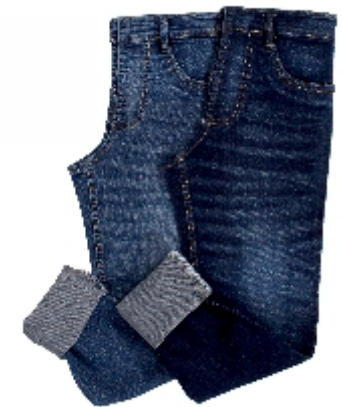
Article : PD E280 Shade : Dark Indigo | Weave : 3/1 RHT Weight : 9.50 Oz/Sq.Yd | Width : 64.00" ± 1 Weft Shrinkage : 12-14%