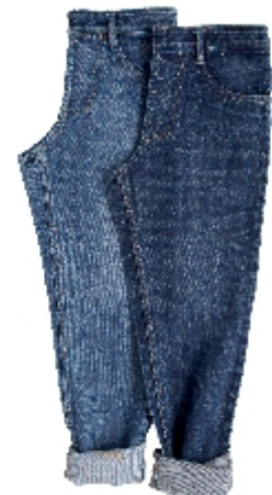
Article : 3941 Shade : Indigo | Weave : 3/1 RHT Weight : 13.75 Oz/Sq.Yd | Width : 67.00" ± 1 Wef Shrinkingage : 0-2%