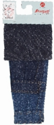
Article : 3944 Shade : Indigo | Weave : 2/1 RHT Weight : 7.00 Oz/Sq.Yd | Width : 67.00" ± 1 Weft Shrinkage : 0-2%