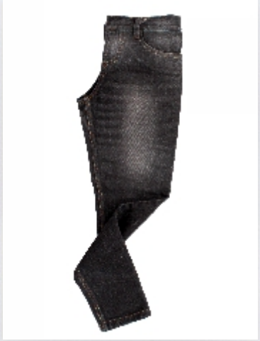
Article : 7112 Shade : Sulphur Black | Weave : 3/1 RHT Weight : 13.00 Oz/Sq.Yd | Width : 60.00" ± 1 Weft Shrinkage : 0-2%