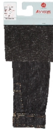
Article : 7090 Shade : Sulphur Black | Weave : 2/1 RHT Weight : 5.25 Oz/Sq.Yd | Width : 63.00" ± 1 Weft Shrinkage : 0-2%