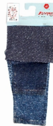
Article : 3627 Shade : Indigo | Weave : 3/1 RHT Weight : 11.75 Oz/Sq.Yd | Width : 67.00" ± 1 Wef Shrinkingage : 0-2%