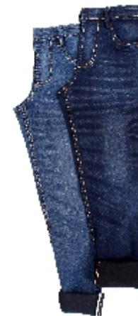
Article : PD E273 Shade : SBIT | Weave : 3/1 RHT Weight : 8.00 Oz/Sq.Yd | Width : 58.00" ± 1 Weft Shrinkage : 10-12%