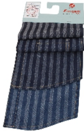
Article : 5464 Shade : Dark Indigo | Weave : Dobby Weight : 5.25 Oz/Sq.Yd | Width : 64.00" ± 1 Weft Shrinkage : 0-2%