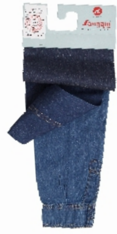
Article : 3270 Shade : Indigo | Weave : 2/1 RHT Weight : 5.25 Oz/Sq.Yd | Width : 63.00" ± 1 Weft Shrinkage : 0-2%