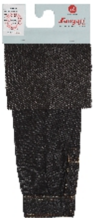
Article : 7097 Shade : Sulphur Black | Weave : 2/1 RHT Weight : 7.00 Oz/Sq.Yd | Width : 68.00" ± 1 Weft Shrinkage : 0-2%