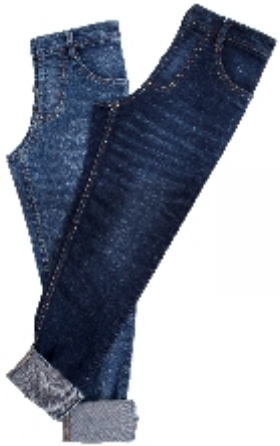
Article : 3204 Shade : Dark Indigo | Weave : 3/1 RHT Weight : 10.75 Oz/Sq.Yd | Width : 71.00" ± 1 Weft Shrinkage : 12-14%