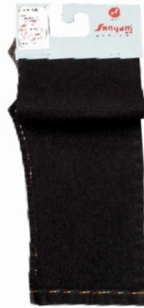
Article : 3519 Shade : Sulphur Black | Weave : 4/1 LHT Satin Weight : 8.50 Oz/Sq.Yd | Width : 57.00" ± 1 Weft Shrinkage : 13-15%