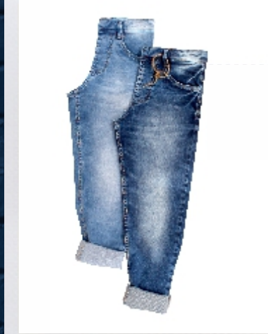
Article : PD E310 Shade : Dark Indigo | Weave : 3/1 RHT Weight : 10.00 Oz/Sq.Yd | Width : 58.00" ± 1 Wefit Shrinkage : 12-14%