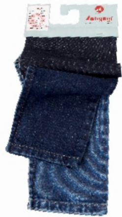
Article : 3415 Shade : Indigo | Weave : 3/1 RHT Weight : 12.25 Oz/Sq.Yd | Width : 67.00" ± 1 Wef Shrinkingage : 0-2%