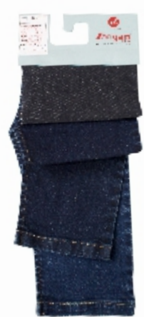
Article : 3640 Shade : Dark Indigo | Weave : 3/1 RHT Weight : 9.75 Oz/Sq.Yd | Width : 61.00" ± 1 Weft Shrinkage : 16-18%