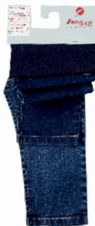
Article : PD D456 Shade : Indigo | Weave : 2/1 RHT Weight : 9.75 Oz/Sq.Yd | Width : 64.00" ± 1 Weft Shrinkage : 10-12%