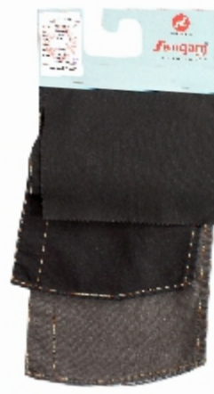
Article : PD E288 Shade : Sulphur Black | Weave : 2/1 RHT Weight : 5.25 Oz/Sq.Yd | Width : 65.00" ± 1 Weft Shrinkage : 0-2%