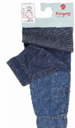
Article : 3573 Shade : Dark Indigo | Weave : 2/1 RHT Weight : 4.50 Oz/Sq.Yd | Width : 61.00" ± 1 Weft Shrinkage : 0-2%