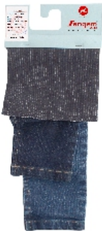
Article : 3689 Shade : Dark Indigo | Weave : 3/1 LHT Weight : 11.50 Oz/Sq.Yd | Width : 66.00" ± 1 Wef Shrinkingage : 0-2%