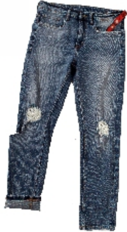
Article : 3214 Shade : Super Dark Indigo | Weave : 3/1 RHT Weight : 12.00 Oz/Sq.Yd | Width : 62.00" ± 1 Weft Shrinkage : 14-16%